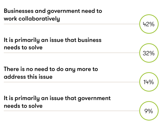
Figure 7: Relative roles government and business should play in addressing the issue of gender inequality

16 Women in business: beyond policy to progress Women in business: beyond policy to progress