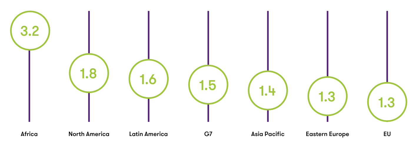
Figure 2: Number of ethnic groups represented by senior management team by region

"Mid-market businesses don't always feel they have sufficient resources to dedicate time to an issue like diversity. They have other priorities on their plate. But the value of diversity is undeniable, and we need to continue making this argument to business."